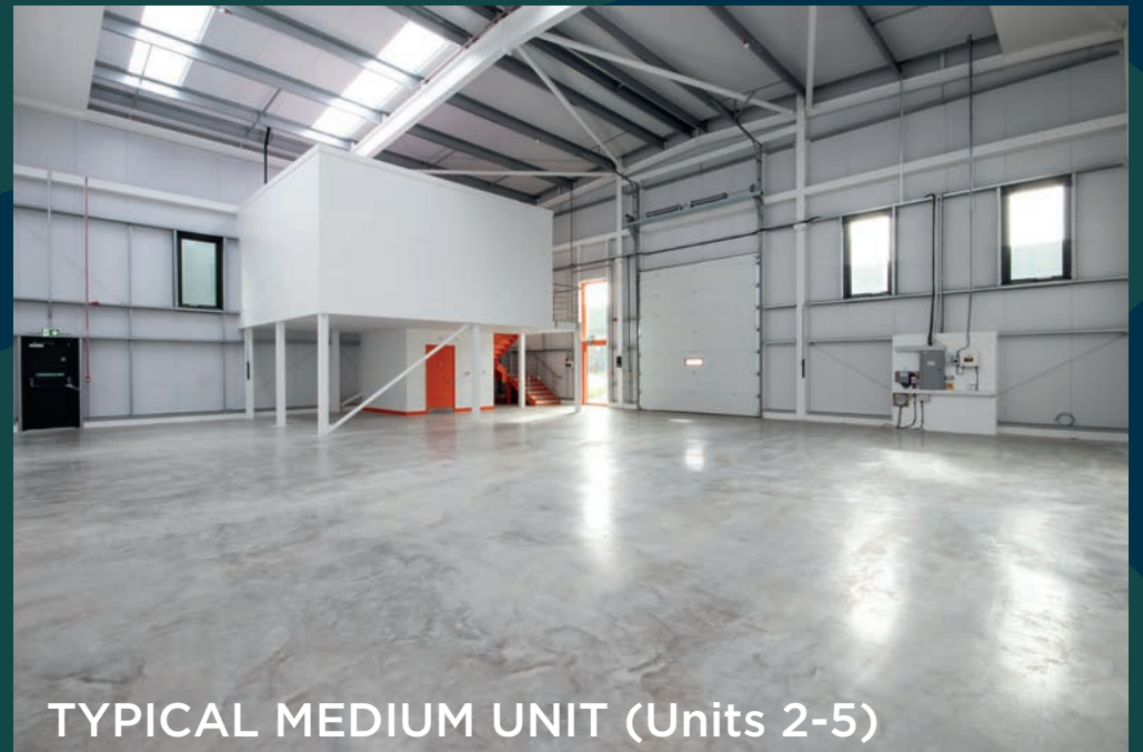
TYPICAL MEDIUM UNIT (Units 2-5)