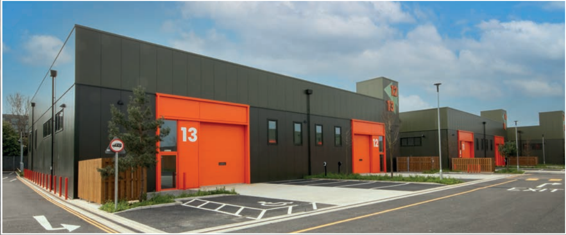
TYPICAL LARGE UNIT (Units 6-13)